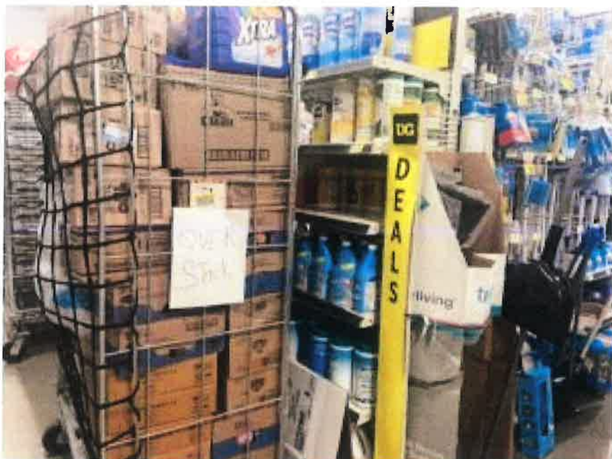
At a dollar store in Conway, NH, aisles are blocked by carts of additional stock.

and storage rooms, blocking emergency exits and creating trip hazards for workers and shoppers. In an OSHA statement, an agency official said that “Dollar Tree Stores have a history of not taking the safety of its workers and customers seriously.” [25] In 2019, the Food and Drug Administration (FDA) sent a warning letter [26] to Dollar Tree for sourcing over-the-counter medications, sold under Dollar Tree’s Assured Brand label, from foreign companies that significantly violate Current Good Manufacturing Practice (CGMP) regulations.